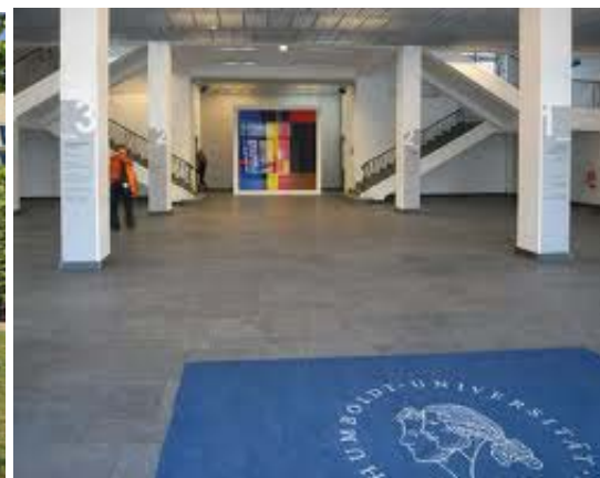
Conference venue 'Seminargebäude am Hegelplatz' (outside and Foyer)